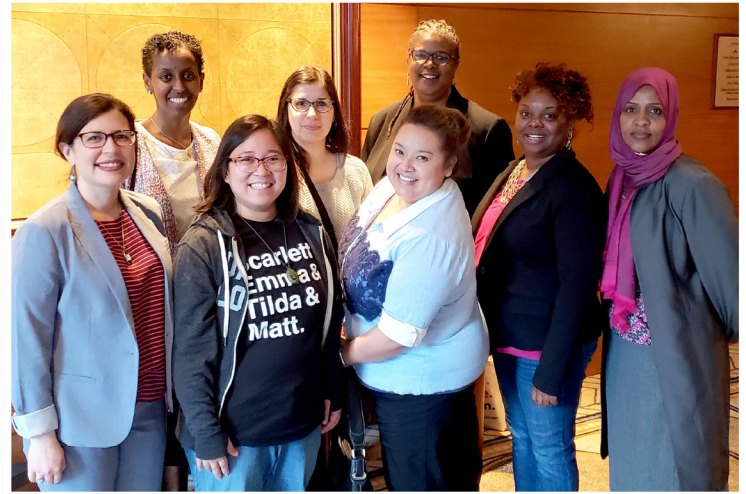
Steering Committee members at the PolicyLink 2018 Equity Summit

For more information visit: www.voicesandchoicesmn.com or contact mlososo@childrensdefense.org