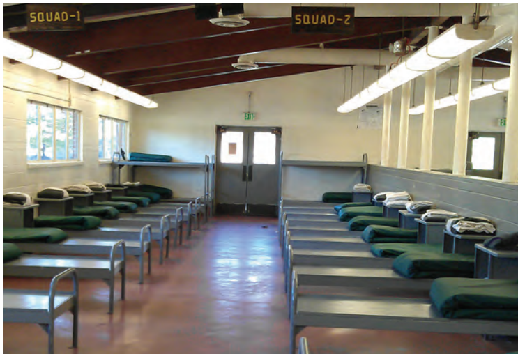
An inside view of the dormitory at Camp Afflerbaugh in La Verne, taken July 24, 2013. Opened in 1961, this juvenile probation camp houses younger boys in one 120-bed open-dormitory style living unit.

a therapeutic environment, form cohesive groups and conduct small-group treatment. For this reason, camps offer treatment programs and evidence-based programs one to two hours a day at most. Some sites provide the programs only a couple hours a week. During the remainder of the day or week, the facilities revert to their routine operations, which do not support—and potentially undermine—the gains youth make during small-group treatment. Moreover, research demonstrates that forcing trauma-exposed youth into one large dormitory leads to increased violence, threats to youth safety and delayed acceptance of rehabilitation. 44 When youth do not feel safe, rehabilitation