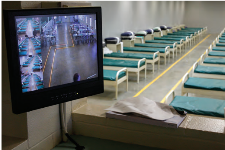
The command center station in the middle of the room projects a long row of beds in Camp Scobee's 100+ bed dormitory at Challenger Memorial Youth Center in Lancaster.

The Los Angeles County juvenile justice system is the largest system in the nation, with locked facilities that include three juvenile halls and fourteen probation camps.