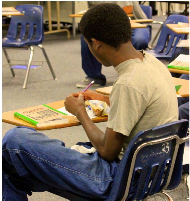
A young man at Camp Afflerbaugh is participating in CDF’s Freedom School program, which piloted in two LA County probation camps in summer 2013.

New programs. The county has implemented an integrated behavioral treatment model 34 at five camps. It consists of a unified approach to screening, assessment, case planning, treatment, transition and after-care (reentry), with all staff members trained to work together with a common vocabulary and common treatment goals. The approach is promising, though the extent of fidelity to the model is unknown and the results have yet to be determined. The Los Angeles County Office of Education has improved its educational programs to increase student engagement and curriculum relevancy, including the project-based and interdisciplinary educational program Road to Success Academy that piloted at camps Scott and Scudder and is now being expanded, and the Children’s Defense Fund Freedom Schools® literacy and enrichment program. Evidence-based programs such as Aggression Replacement Training are now standard throughout the camp system. To support these new programs, the probation department is working to create smaller groups in the dorms when possible. 35