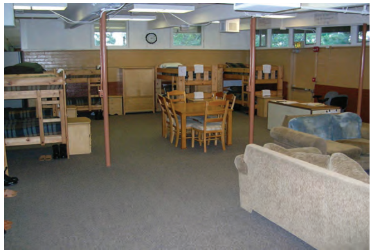
The Santa Clara County Probation Department redesigned its William F. James Boys Ranch with small dorms to create a home-like environment that supports rehabilitation.