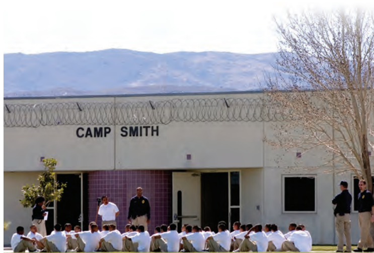
Youth at Camp Smith sit lined up on the field by deputy probation officers before walking to another building for classroom instruction in March 2008. Camp Smith is one of six camps at Challenger Memorial Youth Center, the largest facility in LA County built with a combined 660-bed capacity.

In Los Angeles County, as in counties throughout the state, juvenile probation camps are located in sparsely populated, geographically isolated areas of the county and remain largely correctional in design, with razor wire-topped perimeter fences. 29 Barracks-like