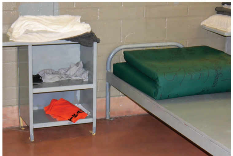
A view of a single bed and shelf in the open dorm at Camp Afflerbaugh in La Verne, taken July 24, 2013. Youth are permitted few personal items and have little to no privacy.

Forcing trauma-exposed youth into one large dormitory leads to increased violence, threats to youth safety and delayed acceptance of rehabilitation.