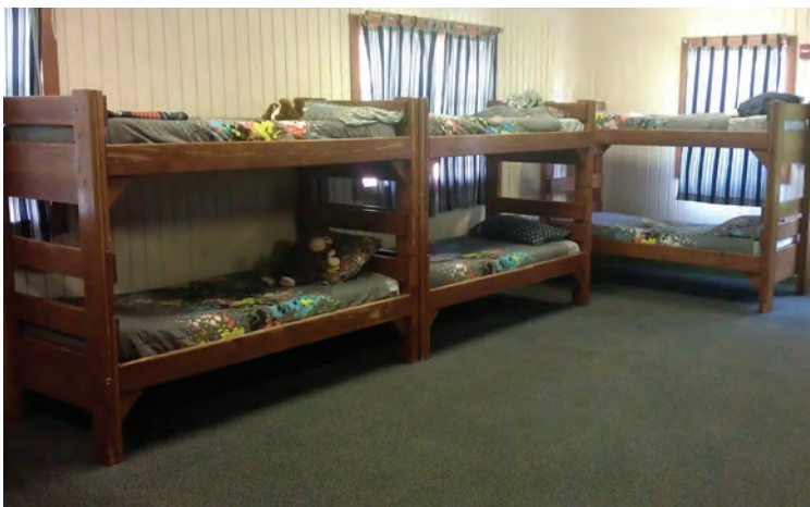
At the Watkins Mill Park Camp in Missouri, as in all secure juvenile facilities run by the state, youth are housed in small, cottage-like dormitories of 12, rather than large locked facilities.

Sites in Louisiana, New Mexico and New York City have also shifted their focus from large, correctional facilities and instead embraced this small group treatment model. These sites have experienced a drop in violent incidents and an improvement in youth-to-staff and youth-to-youth interactions.